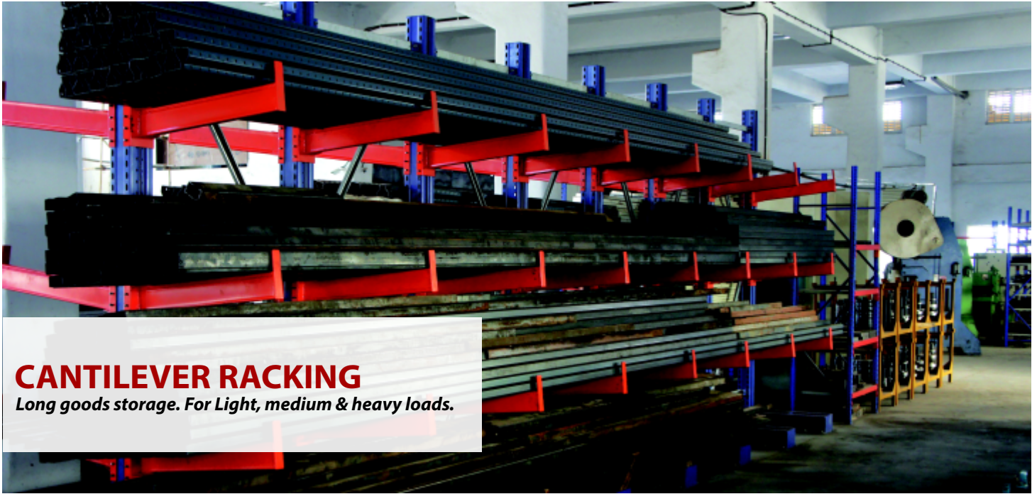
CANTILEVER RACKING Long goods storage. For Light, medium & heavy loads.

Cantilever racking systems are ideal solutions for storage of long, oversized goods or bulky items. Cantilever racking are made up of vertical columns, cantilever arms, bracings & can also be provided with shelves for storage of uneven items or when the goods vary in dimensions or preventing the articles from falling over. Cantilever racking can be manufactured for single or double-faced usage. The arms are adjustable easily to accommodate articles of varying heights. ‘Jay’ offers varied accessories depending on the specific requirements.